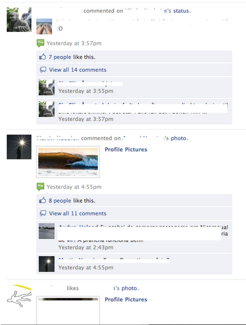
Figure 3. Communication stories (i.e. ‘X commented on Y’s photo’), April 2011.

on me , and my relationships with my ‘friends’. For instance, Top News dynamically updates depending on how many times I visit Facebook. This makes it difficult to make a general claim about the percentage of stories making it to the Top News as the degree of influence the frequency and duration of my visits to Facebook has on the Edges remains unknown. While the dynamic nature of the algorithmic makes analysis of its exact workings difficult, we can, as Mackenzie suggests, treat the algorithm as a particular way of framing the environments it works upon (2007). Writing about the nature of software, Kitchin and Dodge (2011) highlight the power of algorithms to influence how sociality is represented and organized. EdgeRank,